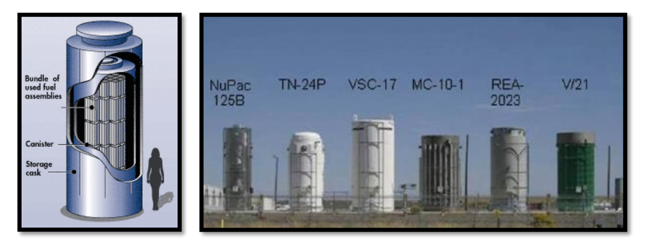
Fig 3 and 4. Example of dry cask storage. Source: [18] (Left); [22] (Right).

The 1995 Idaho Settlement Agreement between the DOE, Navy, and State of Idaho requires the transfer of all the fuel in wet storage to dry storage at INTEC by December 31<sup>st</sup>, 2023. The Idaho Cleanup Project (ICP) managed by Fluor Idaho has just completed removal of all Navy fuel from the basin at INTEC and is currently working on the removal of the Advanced Test Reactor and Experimental Breeder Reactor fuels from wet storage to dry storage. ICP is now also receiving spent fuel from the Advanced Test Reactor canal directly into dry storage. All the INTEC SNF will be removed from wet storage once these fuel transfers are complete. ICP is on schedule to meet the Idaho Settlement Agreement deadline of December 31<sup>st</sup>, 2023.