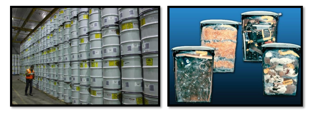
Fig 4. TRU waste in white 55-gal steel drums that are certified and ready to ship to the WIPP ( left ), Source: [21]. Simulated waste inside steel drums ( right ), Source: [22].