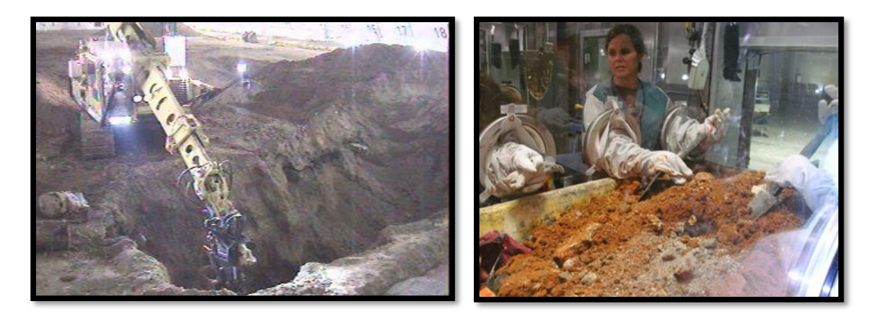
Fig 7. Targeted Waste Exhumation and Inspection Process at ARP. Source: [23]..