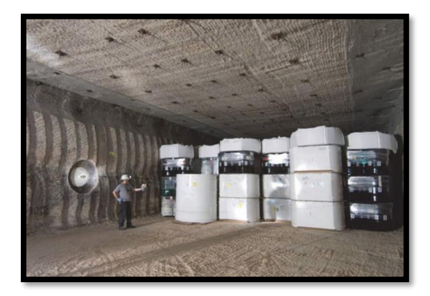
Fig 6. TRU waste disposed underground at WIPP.