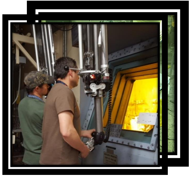
Fig. 5 RH-TRU Waste Processing at INTEC. Source: [23]..