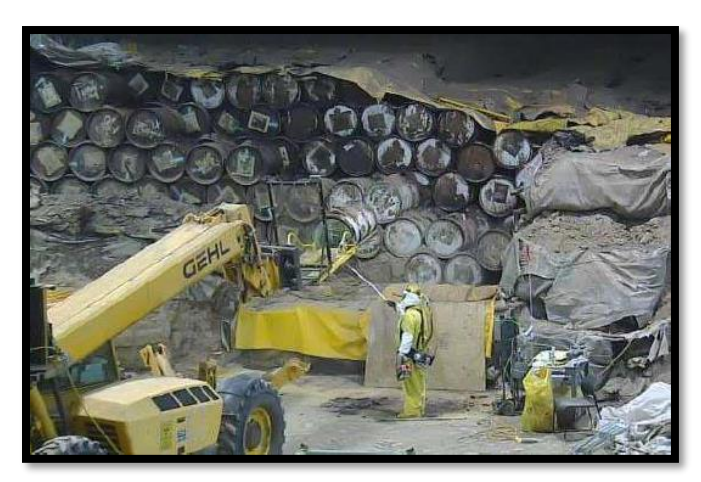
Fig 3. Retrieval of TRU waste. Source: [21].

CH-TRU waste awaiting offsite disposal is primarily stored within steel drums with sizes varying from 55-gal to 100-gal. RH-TRU waste is stored in 55-gal drums and placed in shielded overpacks awaiting shipment.