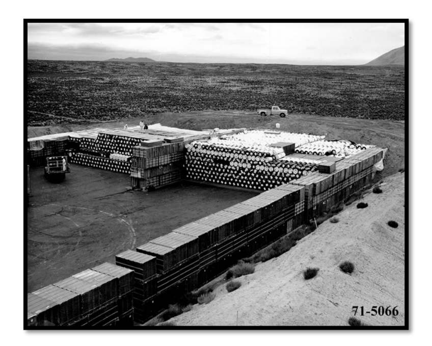
Fig 2. Newly placed drums and boxes of transuranic waste at the RWMC, circa. 1971. The drums and boxes would soon be covered with soil to form a protective berm. Source: [6].

From 1954 until 1970, CH-TRU waste received by INL from the Rocky Flats Plant was permanently buried at the Radioactive Waste Management Complex (RWMC). Within the RWMC, the waste was buried below the ground surface in pits and trenches in a location known as the Subsurface Disposal Area (SDA).