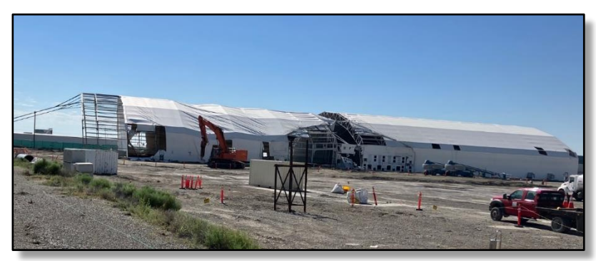
ARP V – Start of D&D