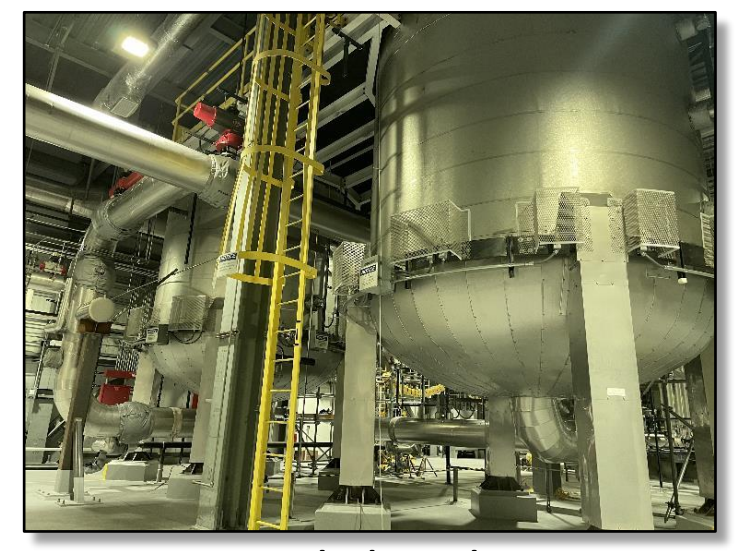
GAC bed vessels